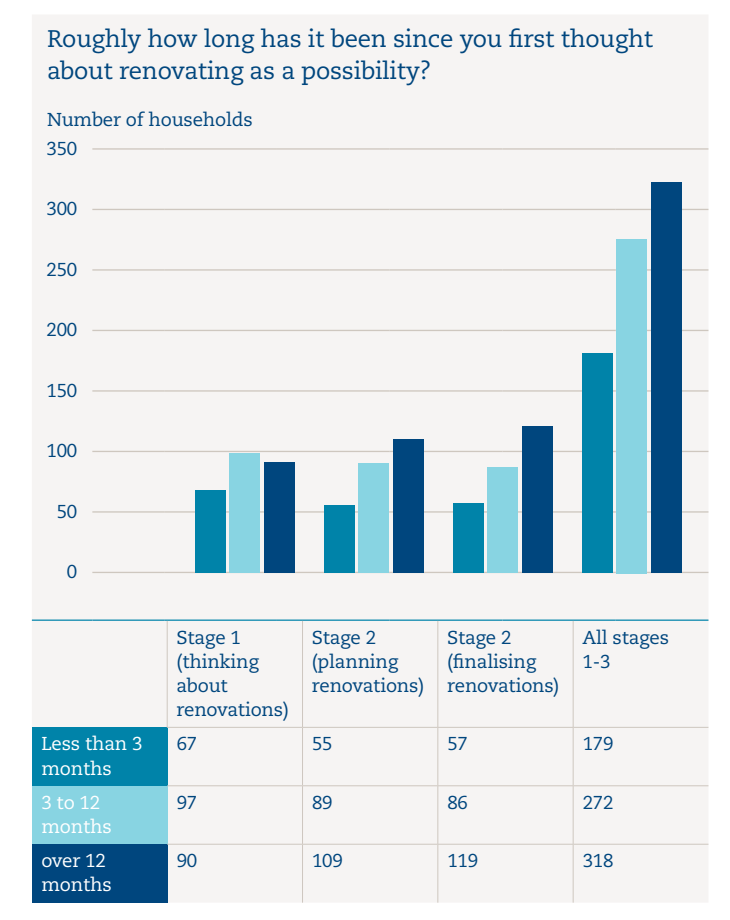
Figure 3. Length of renovation decisions, grouped by decision stage

Decisions about renovating are more likely to take over a year than they are to take less than three months (see Figure 3). Of the households in the sample, only 22% of those finalising their renovation plans had first started thinking about renovating within the previous three months.